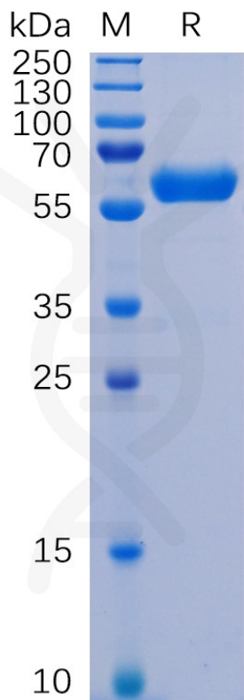
Figure 1. SARS-CoV-2 (2019-nCoV) S protein RBD, hFc Tag on SDS-PAGE under reducing condition.

0.2 µg of S-RBD, hFc Tagged protein per well