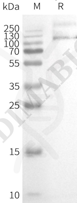
Figure 2. WB analysis of Human TRPV1-Nanodisc with anti-Flag monoclonal antibody at 1/5000 dilution, followed by Goat Anti-Rabbit IgG HRP at 1/5000 dilution