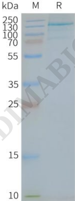
Figure2. Human TLR7-Nanodisc, Flag Tag on SDS-PAGE