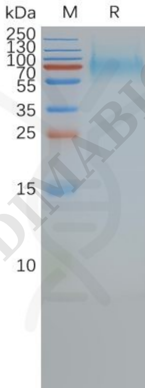
Figure2. Human SSTR2-Nanodisc, His/Flag Tag on SDS-PAGE