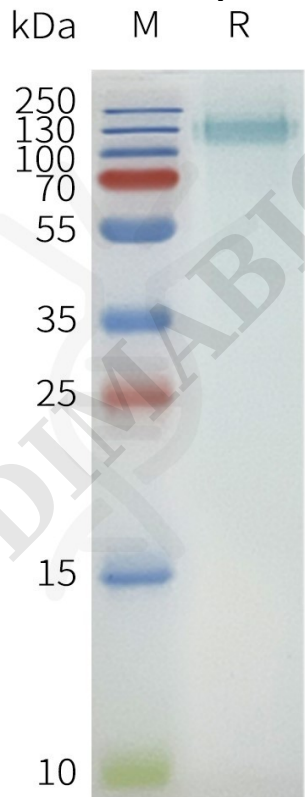
Figure 2. Human SLC34A2-Nanodisc, Flag Tag on SDS-PAGE