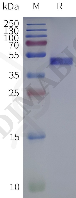
Figure 2. Human RRH-Strep-Nanodisc, C-Flag&Strep Tag on SDS-PAGE