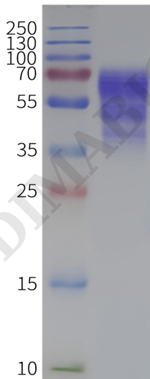
Figure 2. Human PROKR1-Strep-Nanodisc, C-Flag&Strep Tag on SDS-PAGE