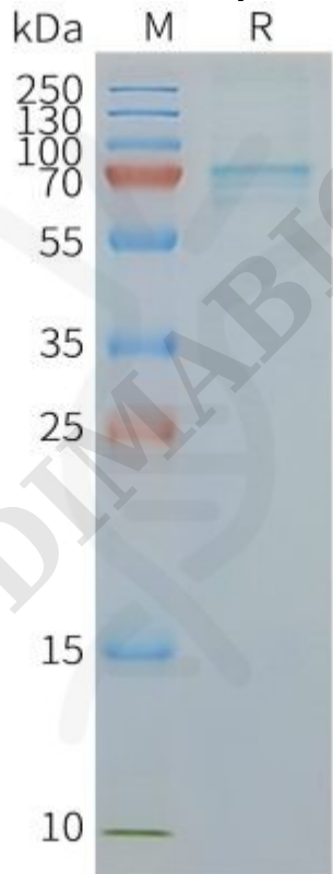
Figure2. Human P2RX7-Nanodisc, Flag Tag on SDS-PAGE