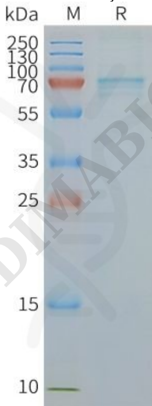
Figure2. Human P2RX7-Nanodisc, Flag Tag on SDS-PAGE