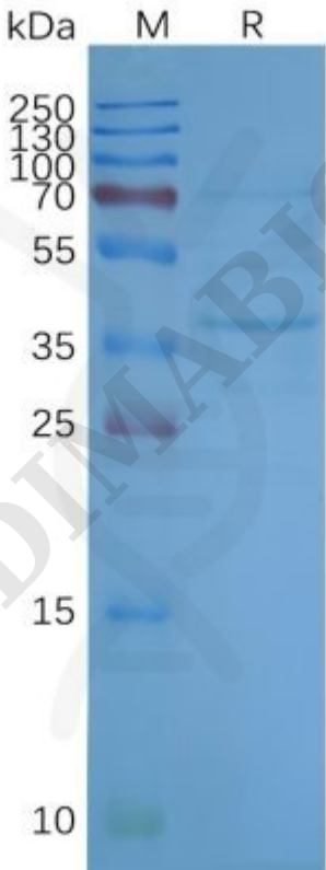
Figure2. Human OR2H1-Nanodisc, Flag Tag on SDS-PAGE