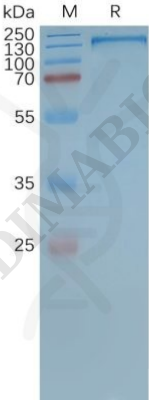
Figure2. Human MDR-1-Nanodisc, Flag Tag on SDS-PAGE