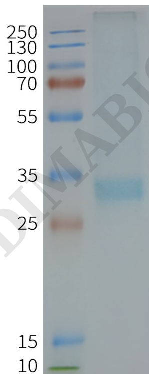
Figure 2. Human MC4R-Nanodisc, Flag Tag on SDS-PAGE