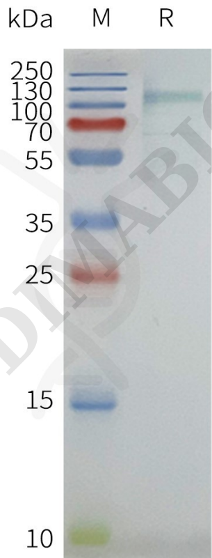
Figure 2. Human MBP-GPR75-Nanodisc with N-MBP Tag, C-Flag Tag on SDS-PAGE