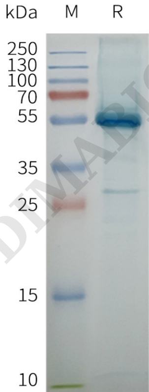
Figure 2. Human MBP-CLDN6-Nanodisc with N-MBP Tag, C-Flag Tag on SDS-PAGE