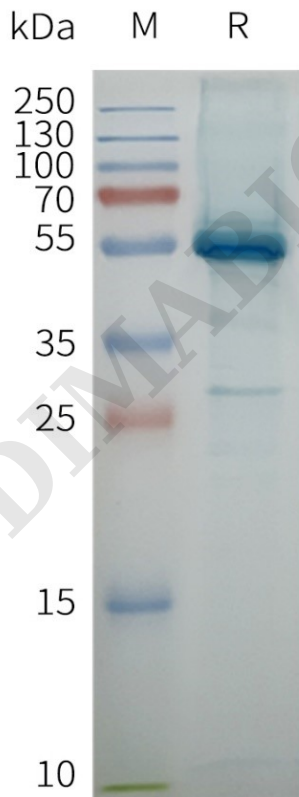
Figure 2. Human MBP-CLDN6-Nanodisc with N-MBP Tag, C-Flag Tag on SDS-PAGE