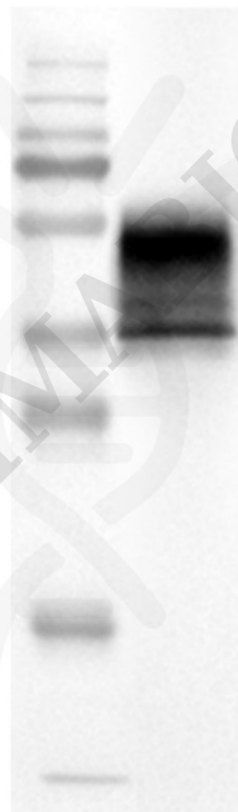
Figure2. WB analysis of Human KISSR-Nanodisc with anti-Flag monoclonal antibody at 1/5000 dilution, followed by Goat Anti-Rabbit IgG HRP at 1/5000 dilution