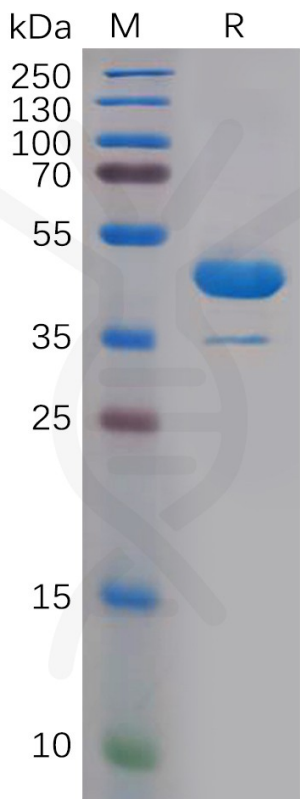
Figure 1. Human IL1A Protein, hFc Tag on SDS-PAGE under reducing condition.