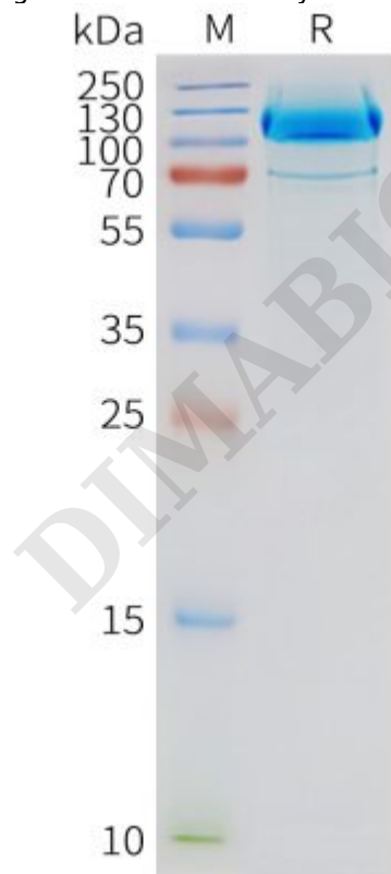
Figure2. Human GRM2-Nanodisc, Flag Tag on SDS-PAGE