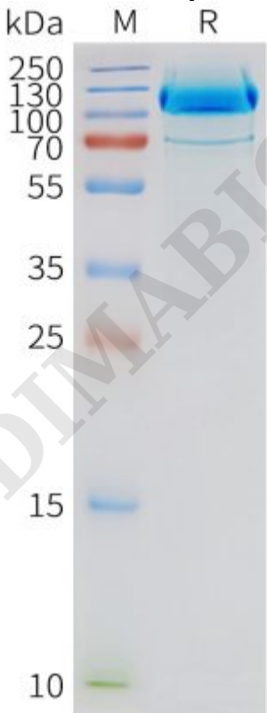
Figure2. Human GRM2-Nanodisc, Flag Tag on SDS-PAGE