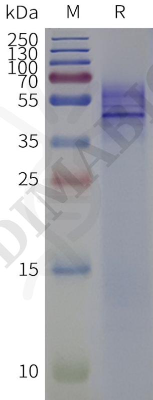
Figure 2. Human GPR87-Strep-Nanodisc, C-Flag&Strep Tag on SDS-PAGE