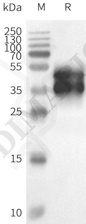
Figure 2. WB analysis of Human GPR6-Strep-Nanodisc with anti-Flag monoclonal antibody at 1/5000 dilution, followed by Goat Anti-Rabbit IgG HRP at 1/5000 dilution