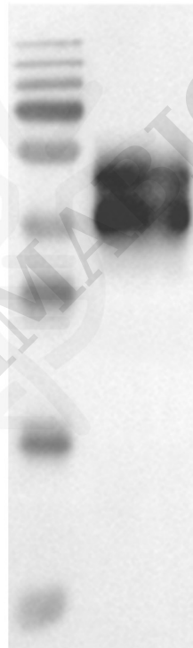
Figure 2. WB analysis of Human GPR6-Strep-Nanodisc with anti-Flag monoclonal antibody at 1/5000 dilution, followed by Goat Anti-Rabbit IgG HRP at 1/5000 dilution