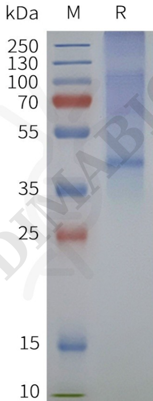
Figure 2. Human GPR4-Strep-Nanodisc, C-Flag&Strep Tag on SDS-PAGE