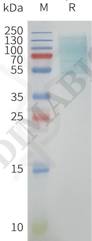
Figure 2. Human GPR39-Nanodisc, Flag Tag on SDS-PAGE