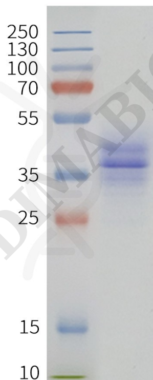
Figure 2. Human GPR15-Strep-Nanodisc, C-Flag&Strep Tag on SDS-PAGE