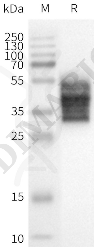
Figure 2. WB analysis of Human GPR132-Nanodisc with anti-Flag monoclonal antibody at 1/5000 dilution, followed by Goat Anti-Rabbit IgG HRP at 1/5000 dilution