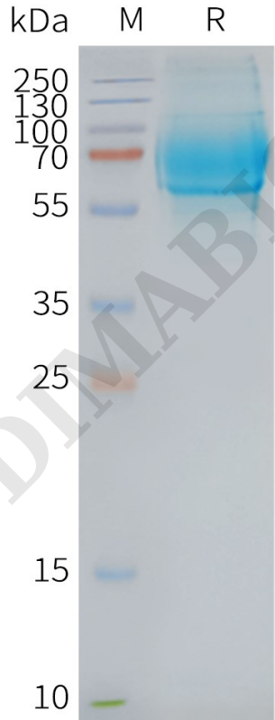
Figure2. Human GCGR-Nanodisc, Flag Tag on SDS-PAGE