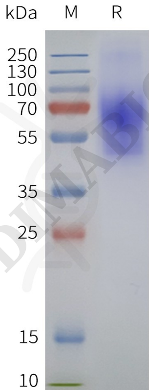
Figure 2. Human GALR1-Strep-Nanodisc, C-Flag&Strep Tag on SDS-PAGE