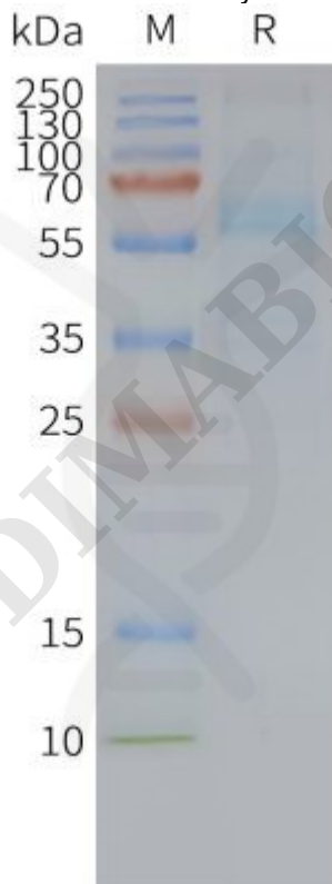
Figure2. Human FZD7-Nanodisc, Flag Tag on SDS-PAGE