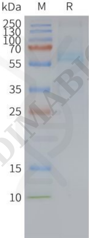
Figure2. Human FZD7-Nanodisc, Flag Tag on SDS-PAGE