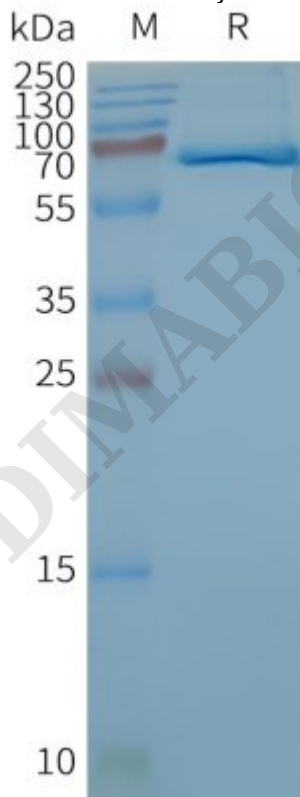
Figure2. Human FZD4-Nanodisc, Flag Tag on SDS-PAGE