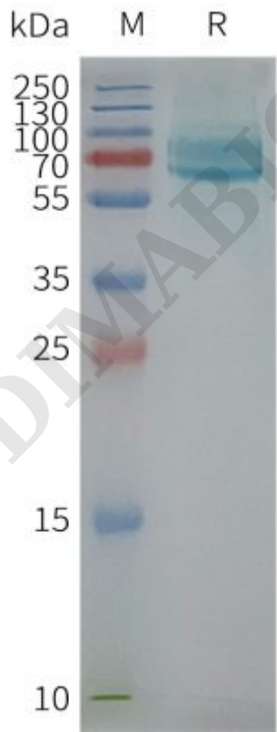
Figure2. Human CD39-Nanodisc, Flag Tag on SDS-PAGE