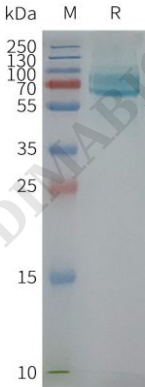
Figure2. Human CD39-Nanodisc, Flag Tag on SDS-PAGE