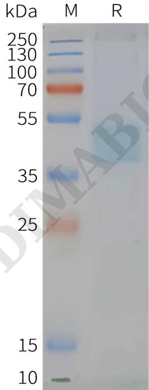
Figure 2. Human CXCR6-Nanodisc, Flag Tag on SDS-PAGE