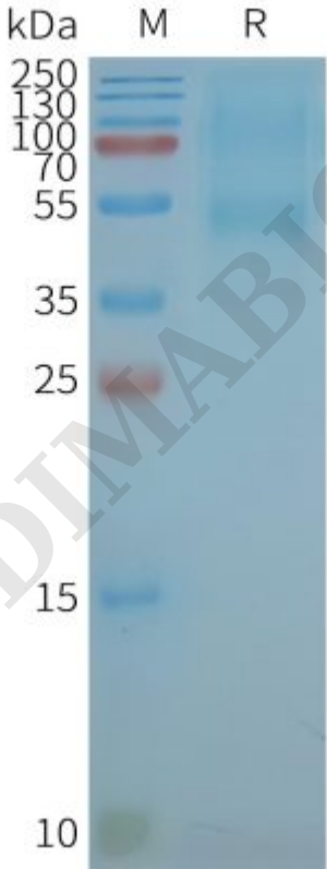
Figure2. Human CXCR5-Nanodisc, Flag Tag on SDS-PAGE