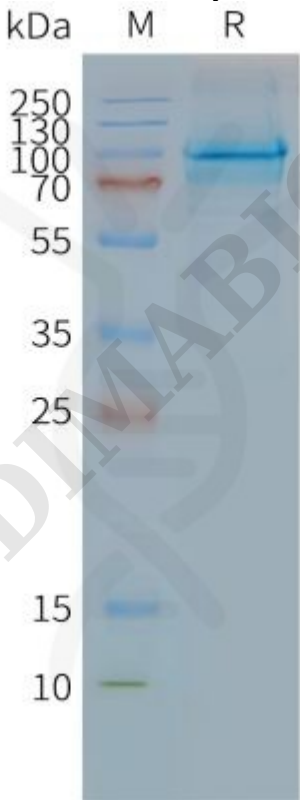
Figure2. Human CLPTM1-Nanodisc, Flag Tag on SDS-PAGE