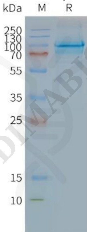
Figure2. Human CLPTM1-Nanodisc, Flag Tag on SDS-PAGE