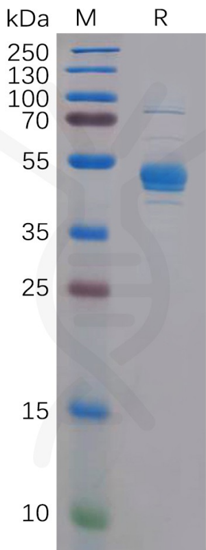
Figure 1. Human CLEC2D Protein, hFc Tag on SDS-PAGE under reducing condition.