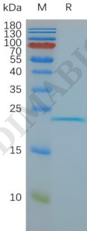
Figure2. Human CLDN6-Nanodisc, Flag Tag on SDS-PAGE