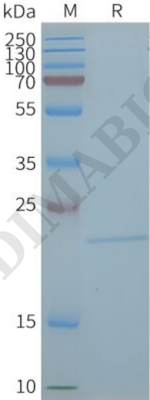
Figure2. Human CLDN5-Nanodisc, Flag Tag on SDS-PAGE