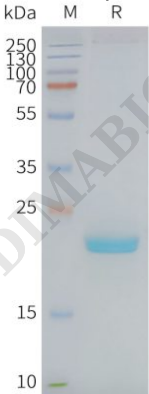
Figure2. Human CLDN4-Nanodisc, Flag Tag on SDS-PAGE