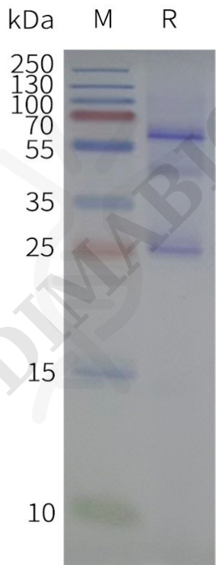
Figure 2. Human CLDN18.1-Strep-Nanodisc, C-Flag&Strep Tag on SDS-PAGE