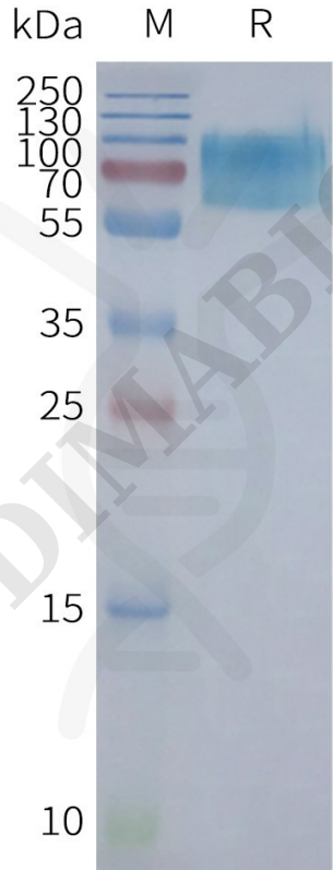
Figure2. Human CHRM2-Nanodisc, Flag Tag on SDS-PAGE