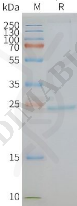
Figure2. Human CD81-Nanodisc, Flag Tag on SDS-PAGE