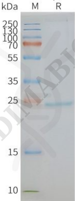
Figure2. Human CD81-Nanodisc, Flag Tag on SDS-PAGE