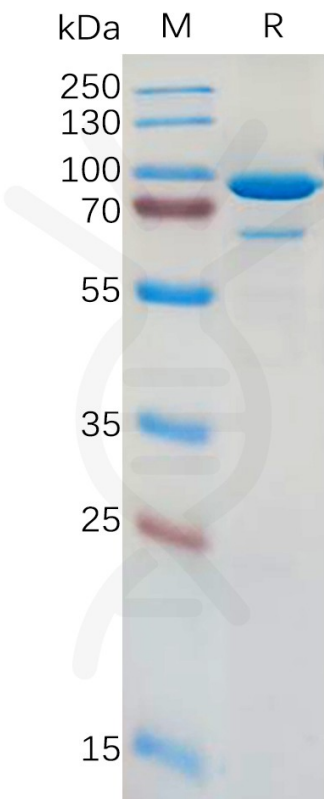
Figure 1. Human CD73 Protein, hFc Tag on SDS-PAGE under reducing condition.