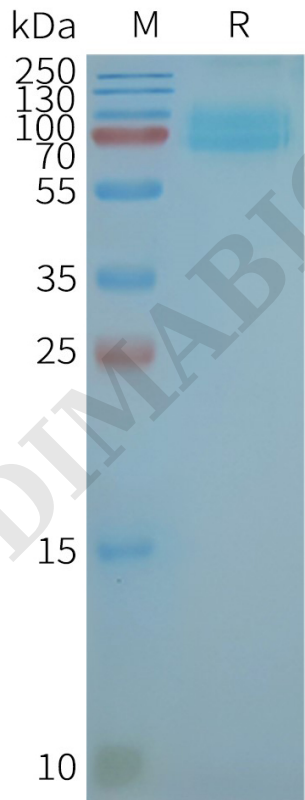
Figure 2. Human CD36-Nanodisc, Flag Tag on SDS-PAGE