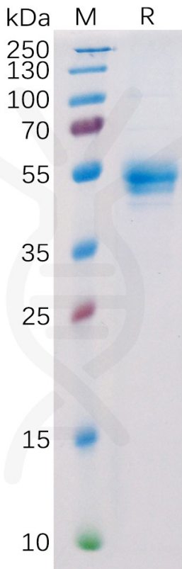
Figure 1. Human CD160 Protein, hFc Tag on SDS-PAGE under reducing condition.