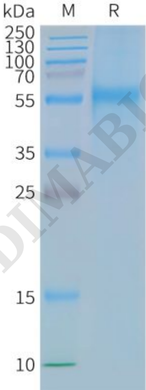
Figure2. Human CCR9-Nanodisc, Flag Tag on SDS-PAGE