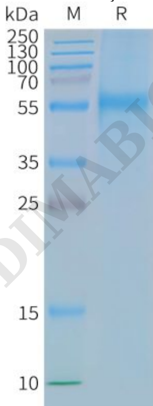
Figure2. Human CCR9-Nanodisc, Flag Tag on SDS-PAGE