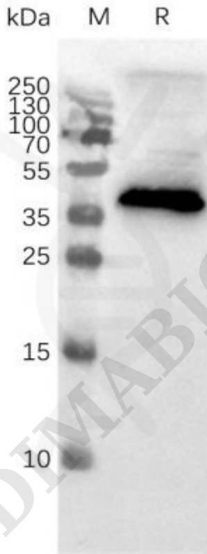
Figure 2. Western blot of CCR8 MNPs