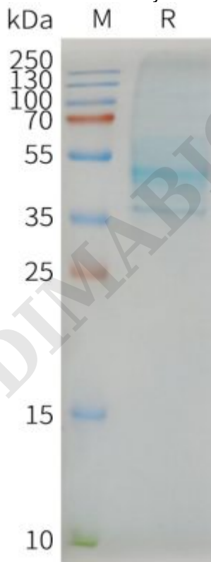
Figure2. Human CCR7-Nanodisc, Flag Tag on SDS-PAGE