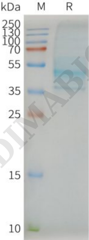
Figure2. Human CCR7-Nanodisc, Flag Tag on SDS-PAGE