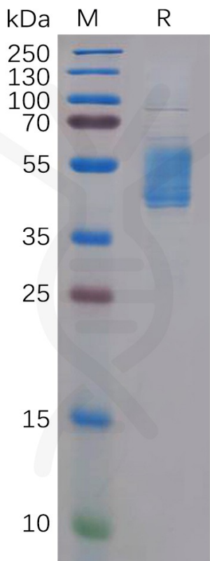
Figure 1. Human CCR4 Protein, hFc Tag on SDS-PAGE under reducing condition.