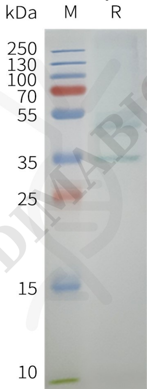
Figure 2. Human CCR10-Nanodisc, Flag Tag on SDS-PAGE