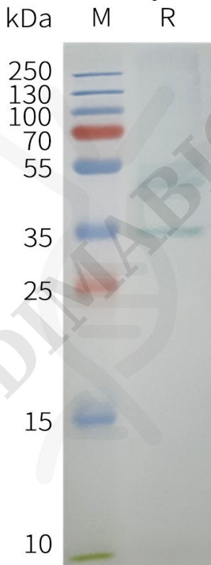
Figure 2. Human CCR10-Nanodisc, Flag Tag on SDS-PAGE