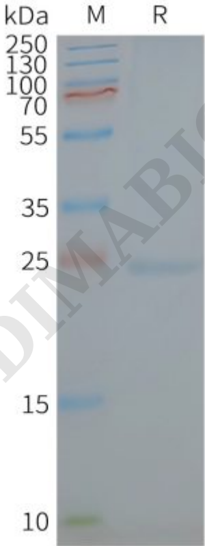
Figure2. Human CAV1-Nanodisc, Flag Tag on SDS-PAGE