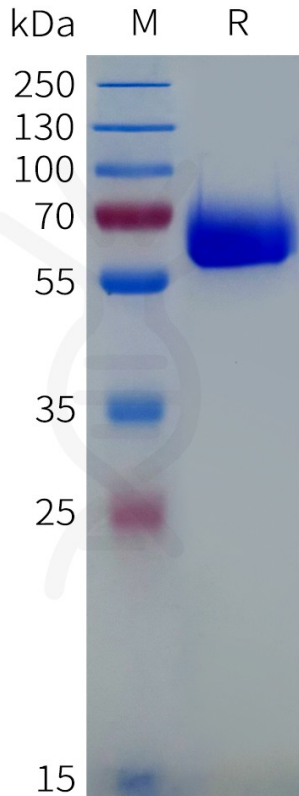
Figure 1. Human B7-H3(29-245) Protein, hFc Tag on SDS-PAGE under reducing condition.