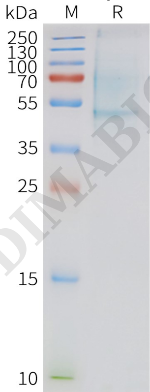
Figure 2. Human APLNR-Nanodisc, Flag Tag on SDS-PAGE