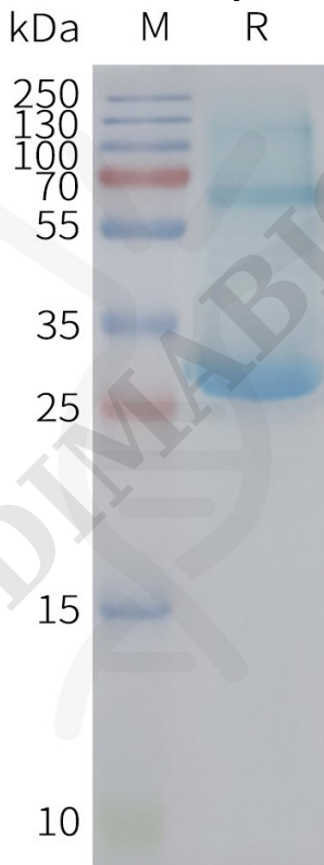
Figure2. Human ADGRE5-Nanodisc, Flag Tag on SDS-PAGE