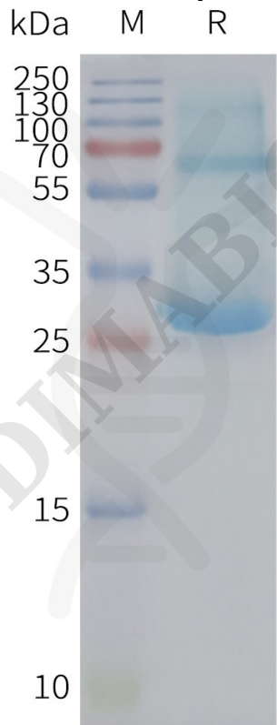
Figure2. Human ADGRE5-Nanodisc, Flag Tag on SDS-PAGE