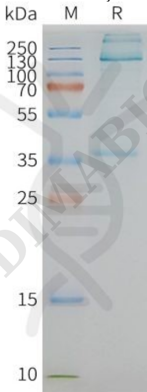
Figure2. Human ADGRE1-Nanodisc, Flag Tag on SDS-PAGE