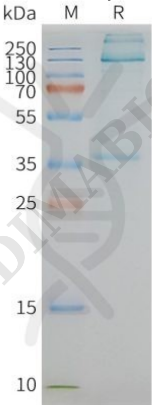
Figure2. Human ADGRE1-Nanodisc, Flag Tag on SDS-PAGE